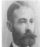
Daniel Hale Williams