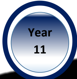
Main Portrait Project