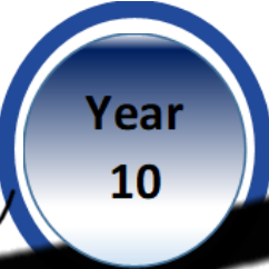
Writing about Art