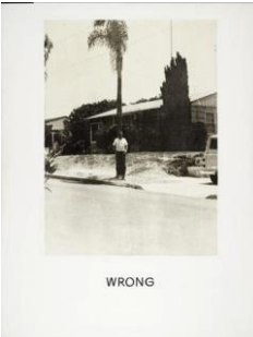
Mini Project 2 (Wrong)

Students will look at the work of Marc P and produce a range of images based on limited and selective colour.